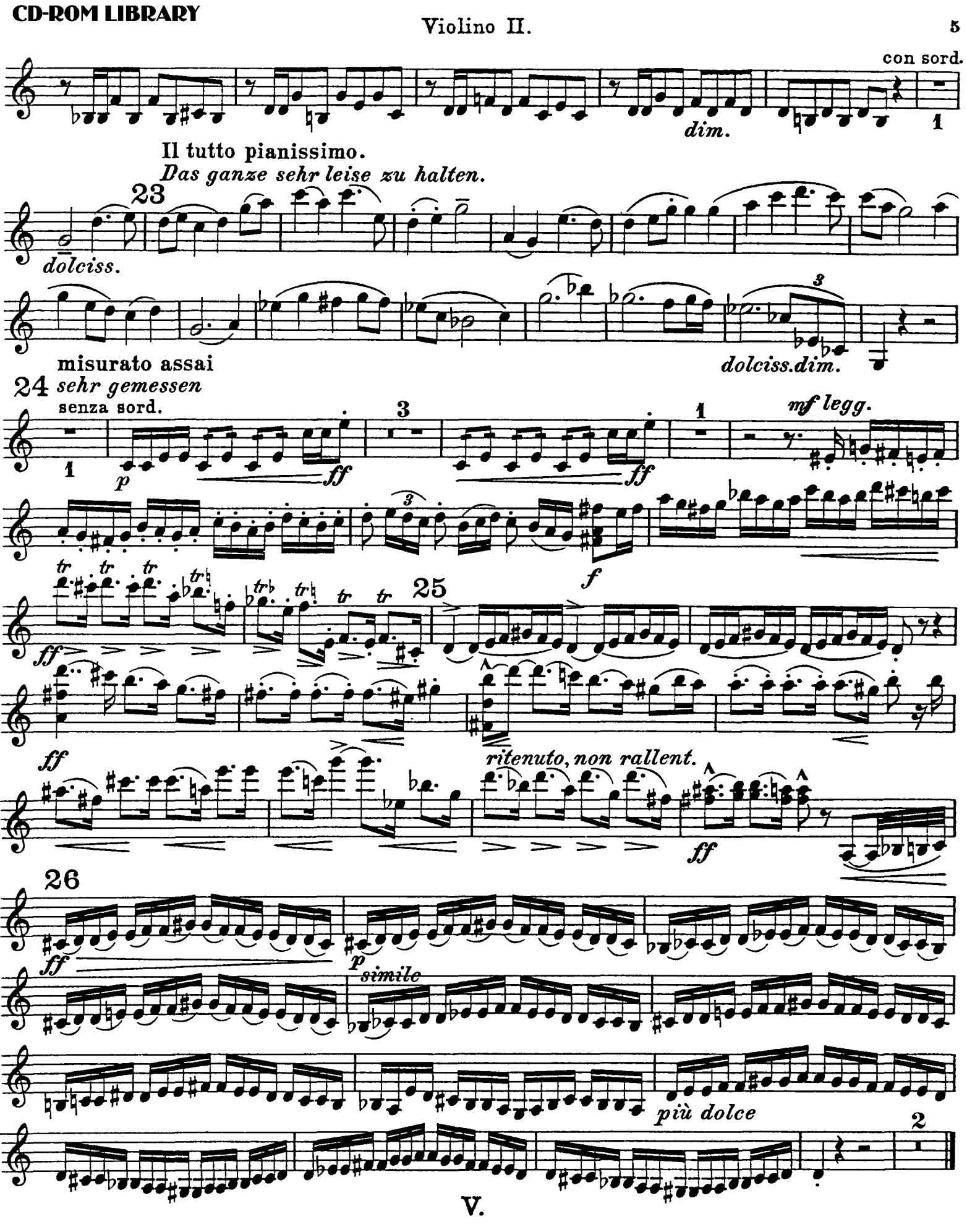
Das Frauengemach. Einleitung zum III.Akt tacet.