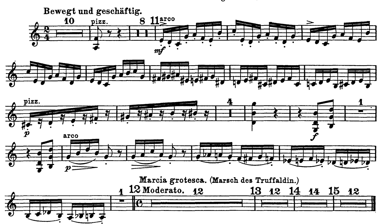
Truffaldino. (Introduzione e marcia grotesca.)