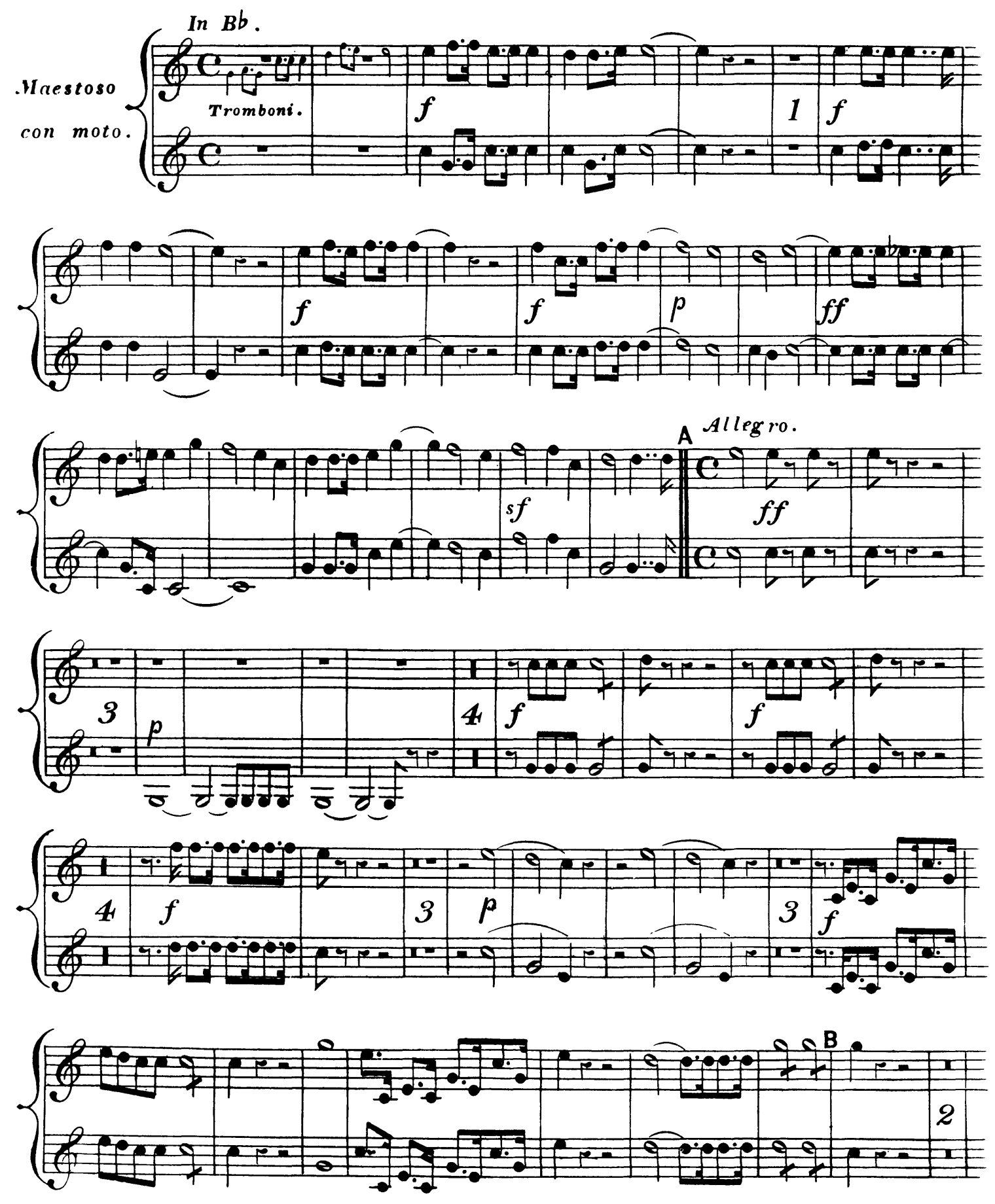
Nº 1. SINFONIA.