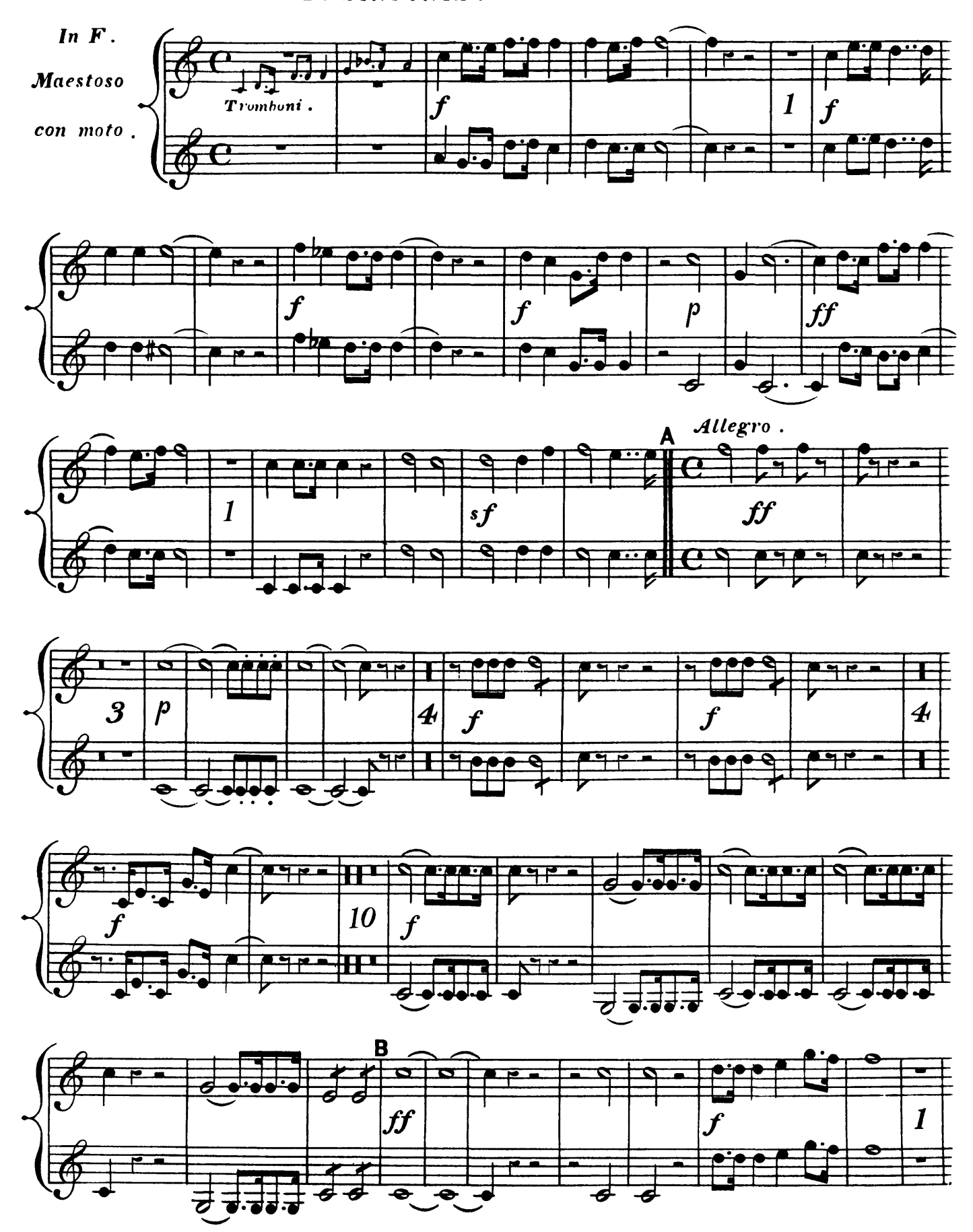
\mathcal{N}^o 1. Sinfonia.