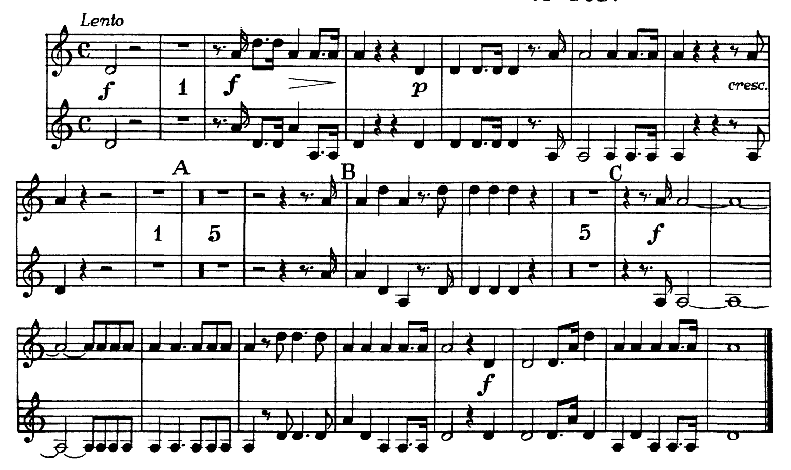
Nº23. AIR. HE WAS DESPISED. Tacent.

Nº 24. CHORUS. SURELY HE HATH BORNE OUR GRIEFS.