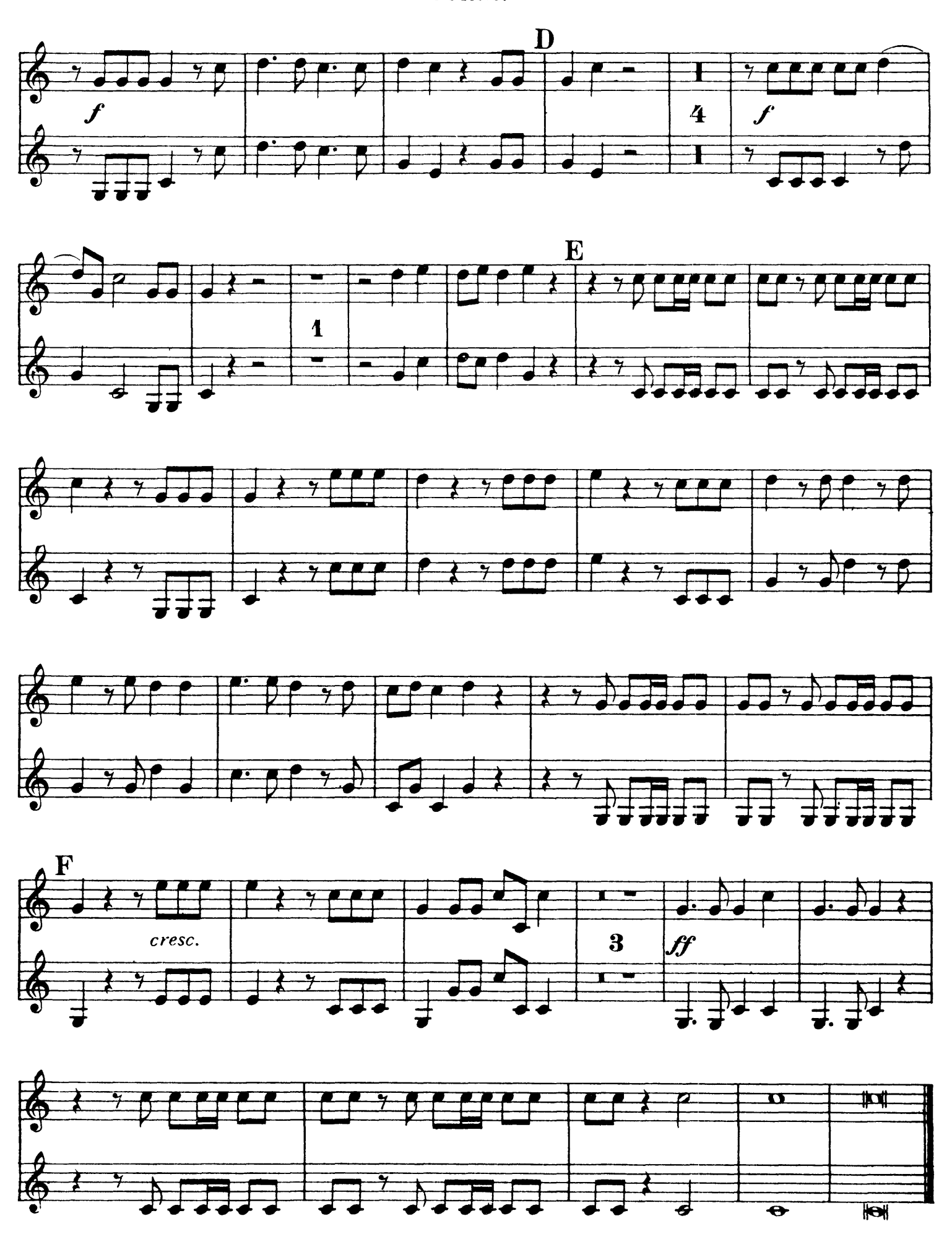
Nos 34 to 36 omitted. See Appendix, page 19.