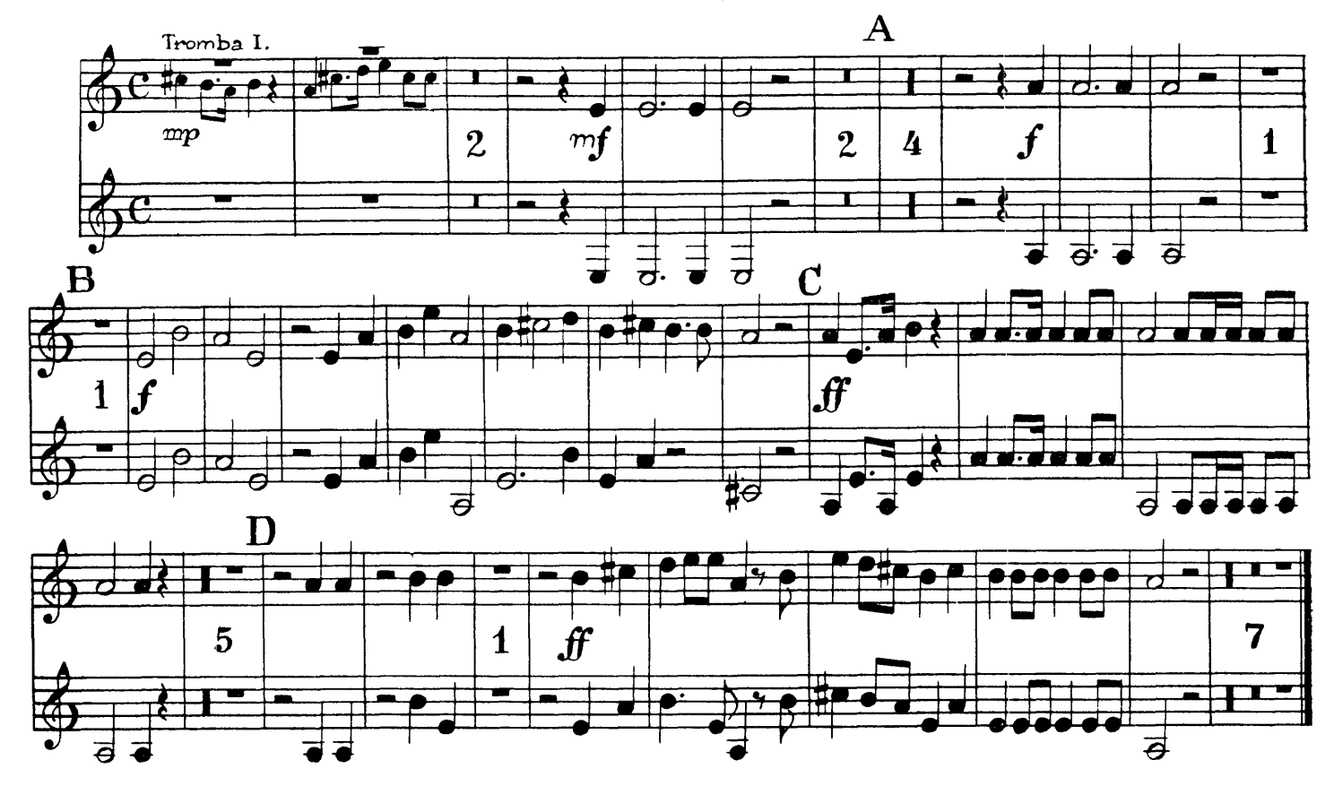
Nos 18 & 19. Tacent.

Nº 20. AIR. HE SHALL FEED HIS FLOCK LIKE A SHEPHERD. Tacet.