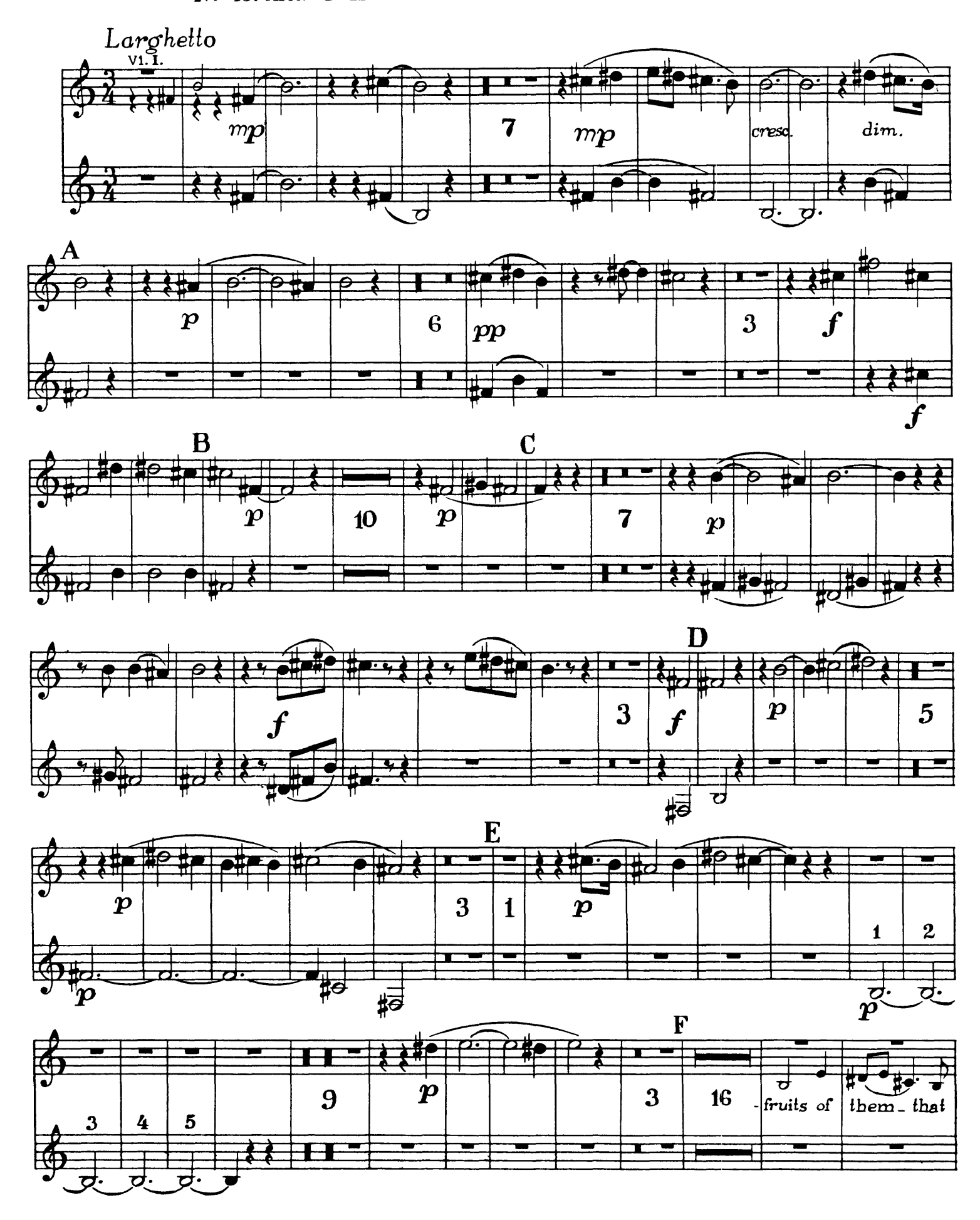
Nº 45. AIR. I KNOW THAT MY REDEEMER LIVETH.