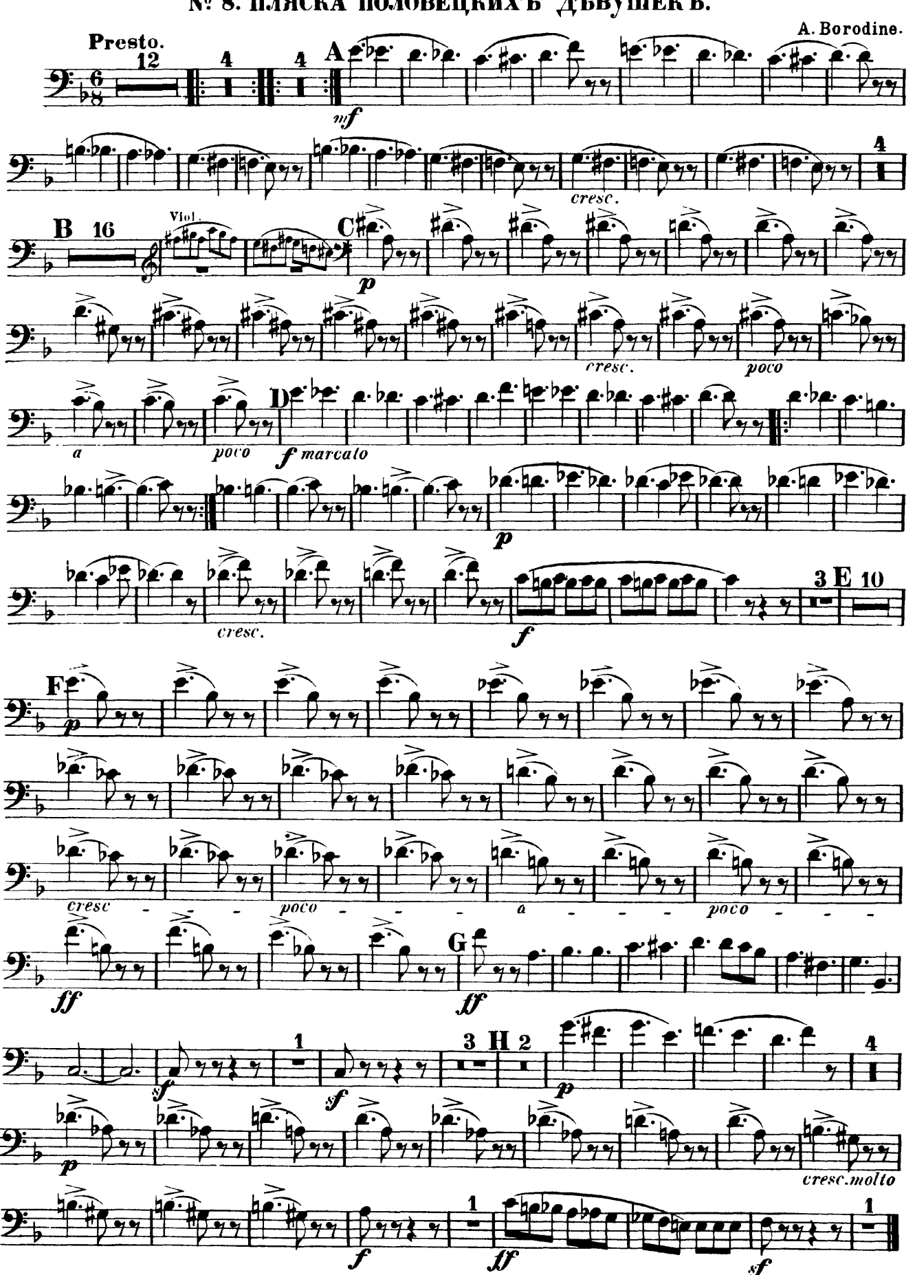
Fagotto I. Nº 8. пляска половецкихъ дъвушекъ.